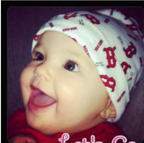
Let's Go Red Sox!