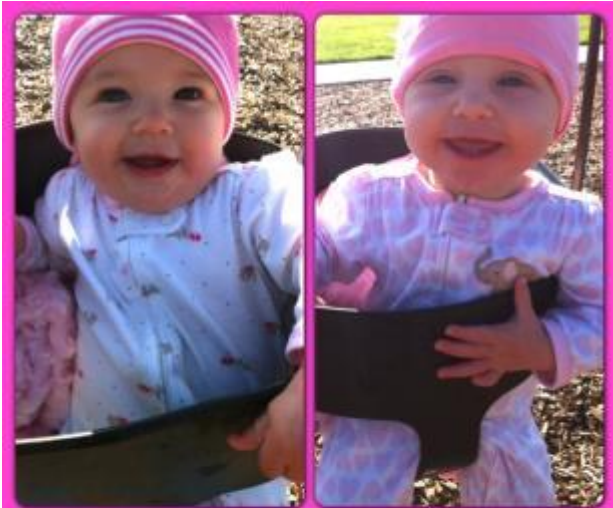
Wheee! We ♡ to swing!